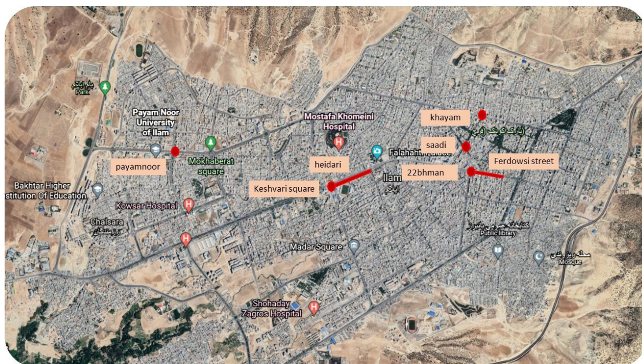
Fig. 1. Location map of the noise measurement points in Ilam city

According to the Iran standard by Department of Environment, the sound level meter was located at a height of 1.5 m above the ground and a distance of 3 m from the sidewalk. Review of studies, parameters and factors that were effective in reducing or increasing the amount of traffic noise, it was found that these parameters can be the amount of heavy vehicle traffic, light vehicle traffic, and tree cover around stations. The mentioned parameters were prepared in the form of a checklist and these parameters were recorded at the same time as measuring the noise level. Then, the measured values were compared with the national allowable limits (the allowable values of noise in the open air of Iran approved by the Supreme Council for Environmental Protection). The results were analyzed with SPSS version 26. In the end, based on the results, solutions to reduce the sound level in the measured points were proposed.